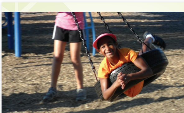
Children across North Carolina have benefited from new playgrounds that were constructed with support from the Parks and Recreation Trust Fund.

The Clean Water Management Trust Fund doesn't just support protection of pristine areas along streams. It has also funded