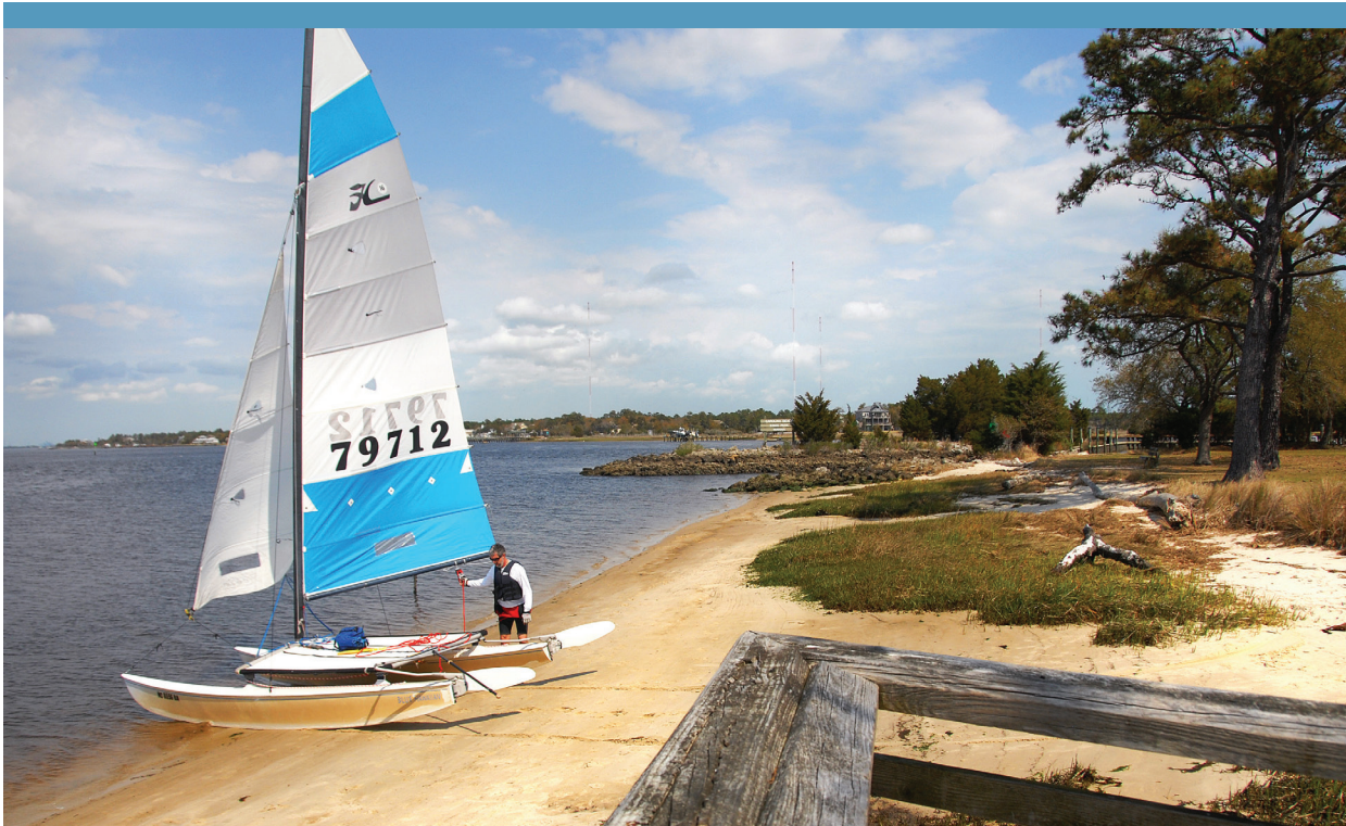
The state's park system recorded a record number of visits in 2012. Parks provide a variety of options for enjoying the outdoors, including sailing at Carolina Beach State Park.

Education Center. The Center opened in 2009 and was funded with a $1 million grant from the Parks and Recreation Trust Fund.