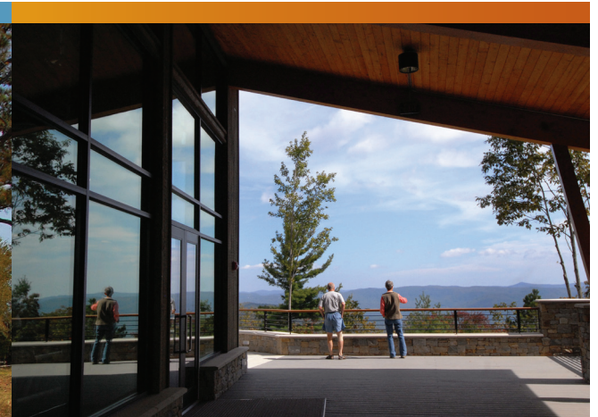
The Parks and Recreation Trust Fund financed a new visitor center at Gorges State Park, which helped to drive up attendance at that park by 22 percent.

A 2008 economic study by North Carolina State University researchers showed that state park visitors spent an average of $23.56 per day. That study also estimated that the state parks' annual economic impact was $400 million and the creation of nearly 5,000 jobs. That number is likely even higher today, because it predated record park attendance.