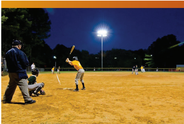
The Parks and Recreation Trust Fund (PARTF) has helped build ballparks across the state, providing recreation and boosting the local economy.

"They spend money here. They stay at motels. They buy food. They buy gas. It is a recreational tool but is also an economic tool," explains Farmer. "It has a tremendous impact on the local economy. We are filling up all the motel rooms and restaurants in Rockingham County."