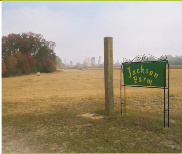
The Jackson Farm in Sampson County will remain a farm, thanks to a conservation easement funded by the Agricultural Development and Farmland Preservation Trust Fund.

The state’s Agricultural Development and Farmland Preservation Trust Fund is designed to stem that loss – to make it possible for farmers to continue to work their land and to help develop markets for their crops.