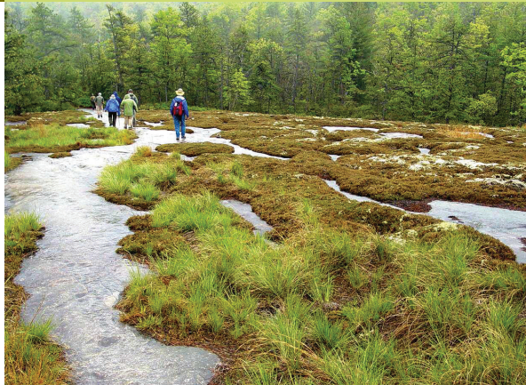
Natural places like Dupont State Forest, which was conserved with the assistance of state trust fund dollars, are an incentive for businesses deciding whether or not to locate in North Carolina.