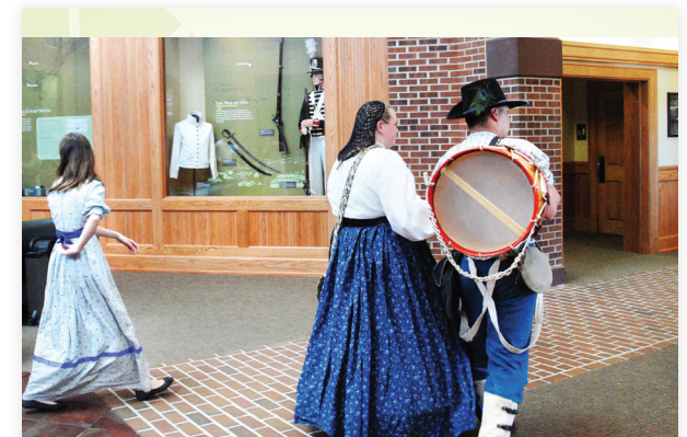
State parks visitor centers serve a variety of purposes – providing high-quality exhibits, teaching auditoriums and classrooms, and they can be reserved for community meetings. Here’s a commemoration of the 150th anniversary of the Battle of Fort Macon.

Fort Macon State Park in Carteret County had the highest number of visits in 2012 at 1.24 million. One of Fort Macon’s major attractions is its state-of-the-art Coastal Environmental