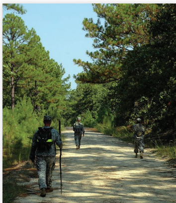
North Carolina's conservation trust funds help to keep Fort Bragg and other state military bases operating.