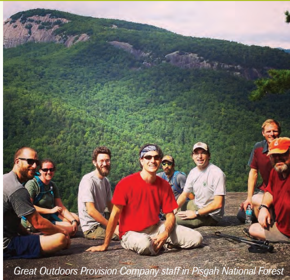
Great Outdoor Provision Company staff in Pisgah National Forest