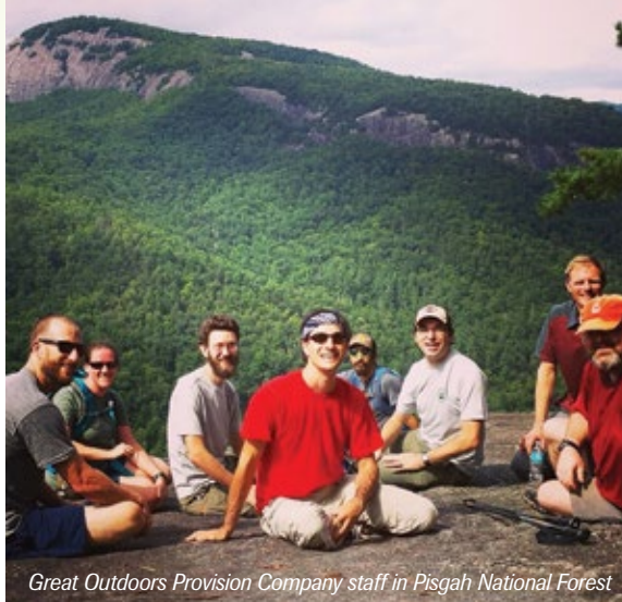
Great Outdoors Provision Company staff in Pisgah National Forest